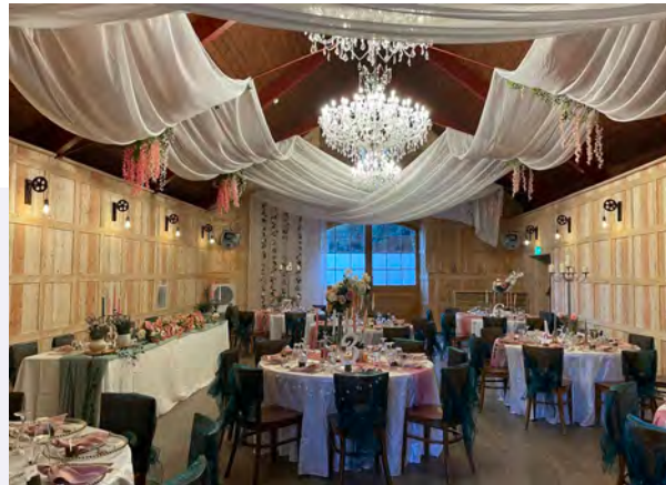
The Flower Room